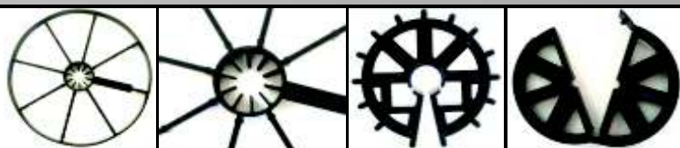
75mm Webbed Wheel